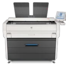
MFP - Single Footprint System

The KIP 7100 provides operators with the flexibility to direct prints and copies to a preferred output destination – the integrated top stacking system and/or to an optional rear KIP stacking system for increased production. KIP 7100 systems deliver the best of both worlds: walkup convenience and production printing!