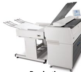
Production Print Stacking