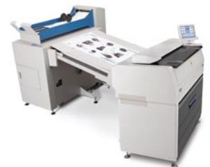
Auto Stacking & Folding