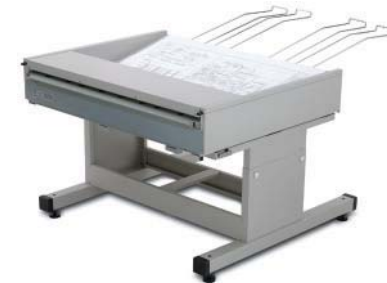
KIP 1200 Stacker Stacks up to 1000 A-E size prints/copies