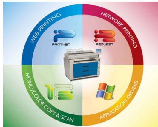
Integrated and Powerful Wide Format Imaging Software

The KIP Image Processing System is a combination of processing power and flexible software applications designed for maximum productivity and ease-of-use. Applications are available on PC workstations, over the internet and at the KIP 9000 touch screen operator panel, providing a uniform user interface across the entire KIP digital product range. All applications have been designed to provide exceptional versatility, fast file processing and efficient use of network resources to maintain high productivity.